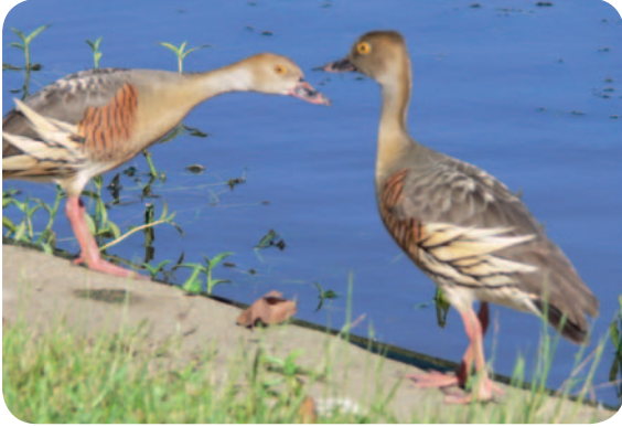
Name: Plumed Whistling-Duck ( Dendrocygna eytoni )