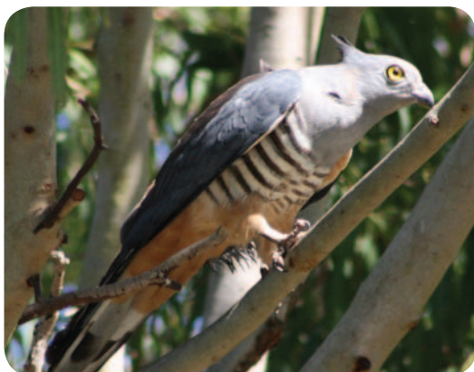
Name: Pacific Baza ( Aviceda subcristata ) Size (height): 35-45cm