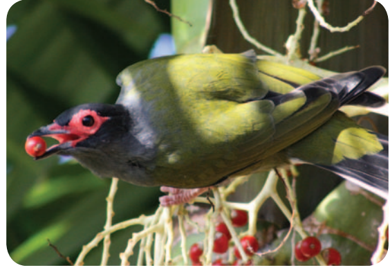
Name: Australasian Figbird ( Sphecotheres vieilloti )

Long-necked duck with brown upperparts, paler underparts and a white rump. The chest is chestnut with thin black bars, while long black-margined plumes arise from its flanks. Its bill and legs are pink, and its iris is yellow. The male and female are similar in appearance. The species has a characteristic lowered neck and short, dark, rounded wings while flying.