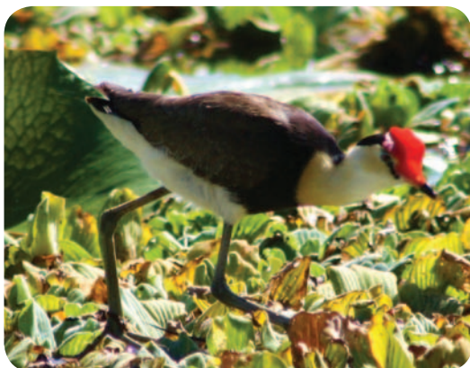
Name: Comb-crested Jacana ( Irediparra gallinacea ) Size (height): 20-23cm