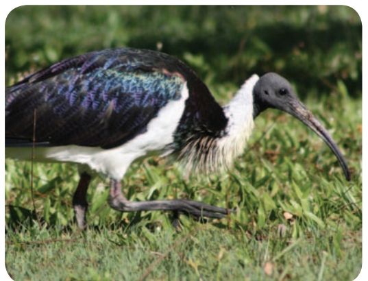
Name: Straw-necked Ibis ( Threskiornis spinicollis ) Size (height): 59-76cm