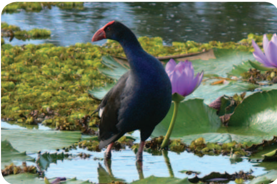
Name: Purple Swamphen ( Porphyrio porphyrio )

Males have bare, red skin around the eye, contrasting against a black crown and grey neck and throat. The remainder of the body is olive-green, except for a white under-tail area. Females have grey skin around the eye and lack distinctive head markings. They are brown-green above and dull-white below, streaked with brown. Both sexes have a blackish bill.