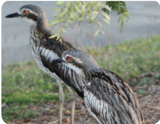
Name: Bush Stone-curlew ( Burhinus grallarius ) Size (height): 52-58cm