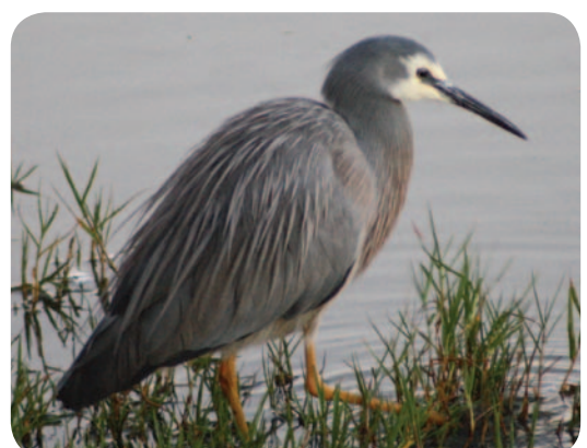
Name: White-faced Heron ( Egretta novaehollandiae ) Size (height): 60-70cm