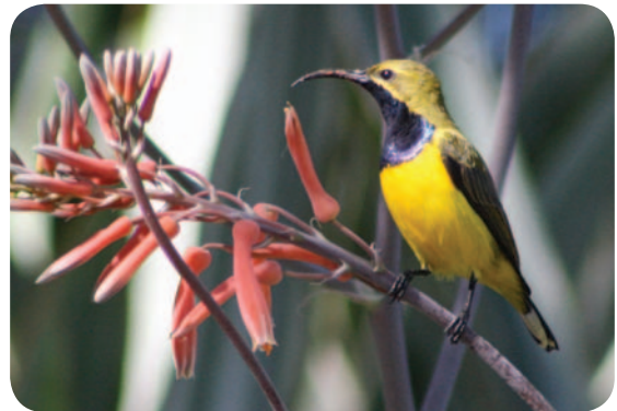
Name: Olive-backed Sunbird ( Nectarinia jugularis )

Large, conspicuous waterhen, dusky black above, with a broad dark blue collar, and dark blue to purple below. As the Purple Swamphen walks, it flicks its tail up and down, revealing its white undertail. The bill is red and robust, the legs and feet orange-red. Found around Mackay on lagoons swamps, lakes & shallow rivers, they tend live in territorial groups to open communities.