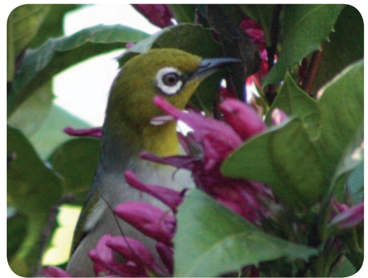
Name: Silvereye ( Zosterops lateralis ) Size (height): 10-12cm